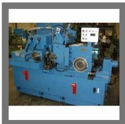
Centerless Grinding Service