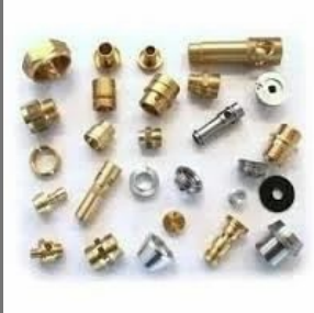
Precision Turned Parts