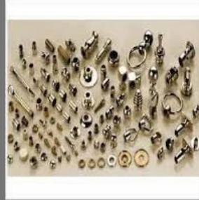
Precision Turned Components