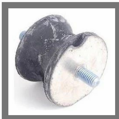
Auto Fitment Spare