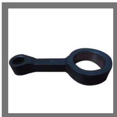
Compressor Connecting Rod