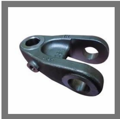
Automotive Turned Components