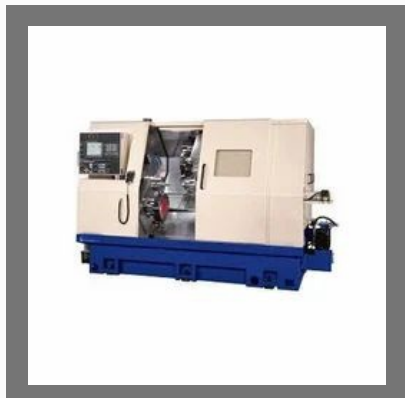
CNC Machine Job Work