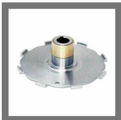
Four Wheeler Plate Bush