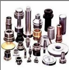
CNC Precision Turned Components