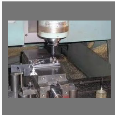
CNC Machining Work