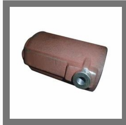
Automotive Turned Parts