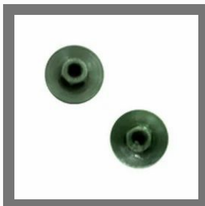
Plate Push Auto Clutch